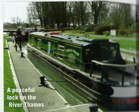
A peaceful lock on the River Thames