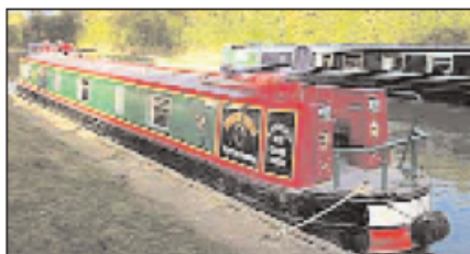
The American Thrush and below, one of the canal homes

It was obvious to many that we were new to the boating game, as we zig-zagged across the canal.